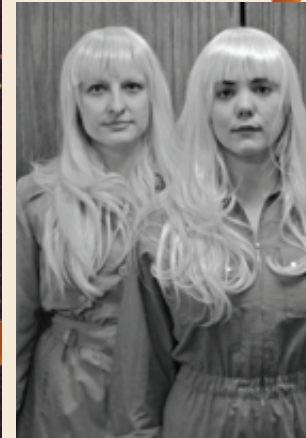
24 HOUR GYM